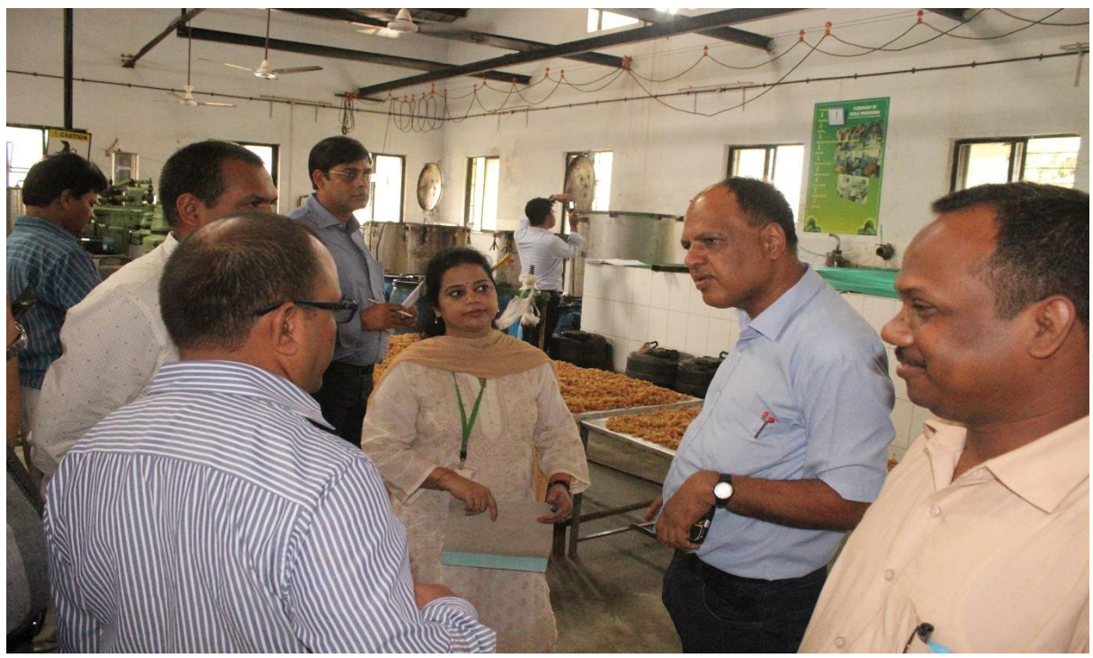
Mango processing unit of the Producers organisation