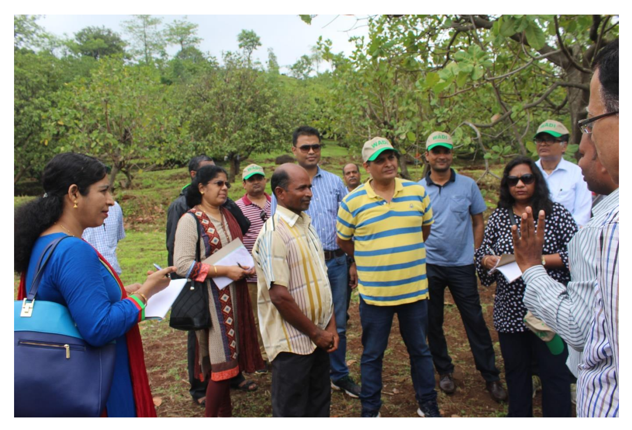
Interface with tribal farmer on WADI in his farm