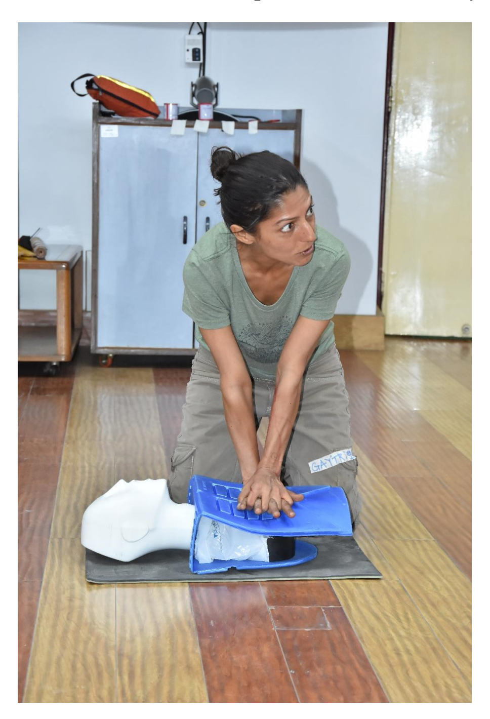
First-Aid - CPR course and Workshop for Protocol and Security Officers