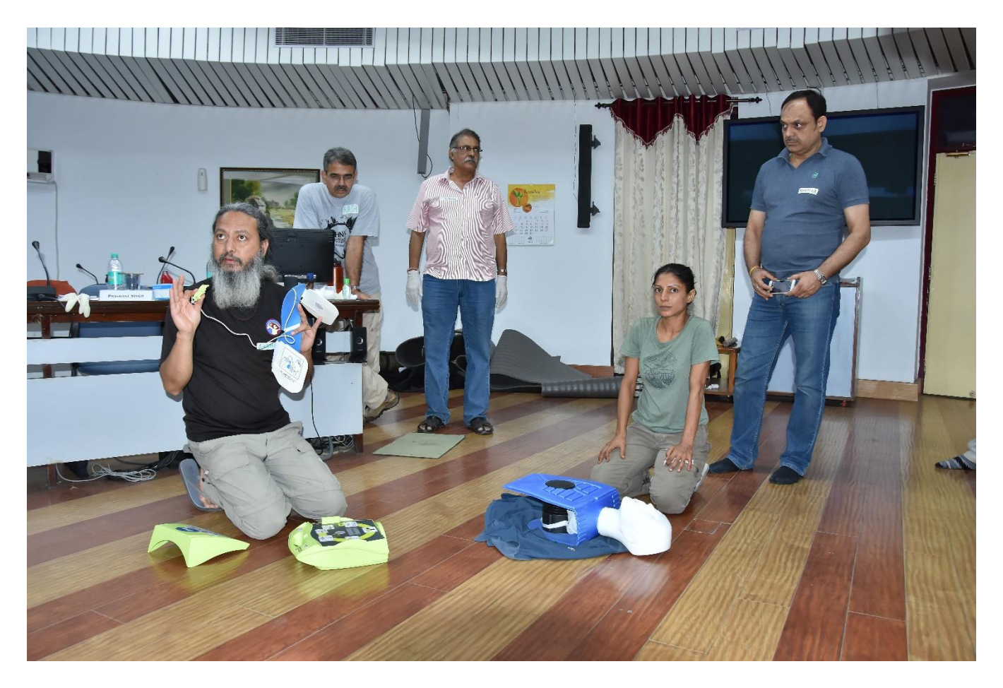
Demonstration of use of AED (Automated External Defibrillator) in CPR