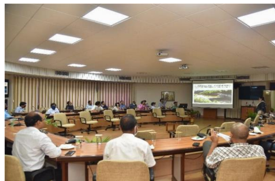
Hindi Quiz on 'Environment'