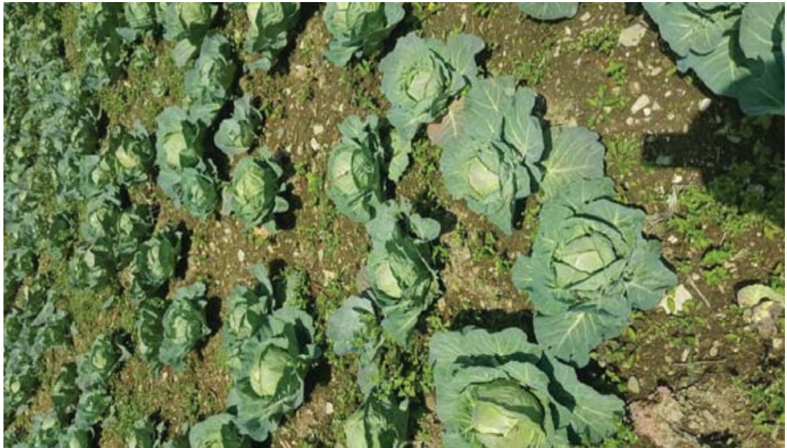
Organic cabbage in the marginal land of Sajong, East Sikkim